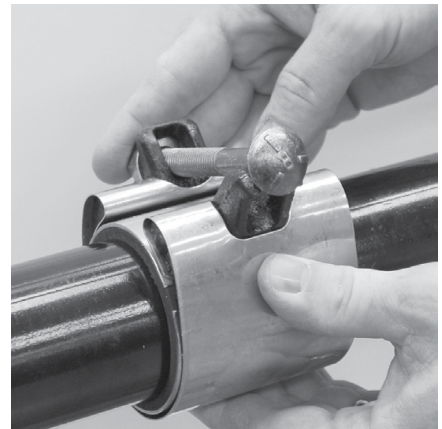
Drop in the bolt and tighten.